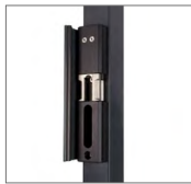
Modulec 2 (Electric Keep)