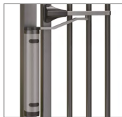
Hydraulic gate closer