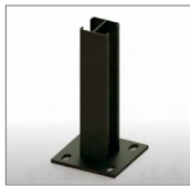
Foot plate for installation on concrete