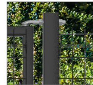
Solid and easy to adjust hot-dip galvanised M16 hinges