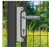
Universal gate catcher made out of aluminium